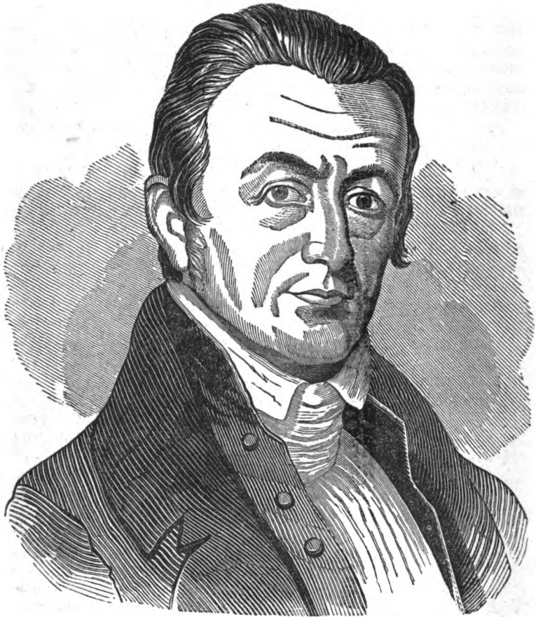
ABONIRAM JUDSON, D. D., MISSIONARY TO BURMAH.